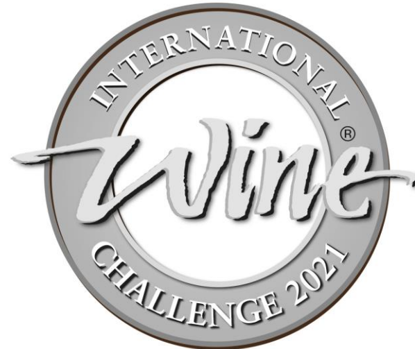
Dated Master Logo